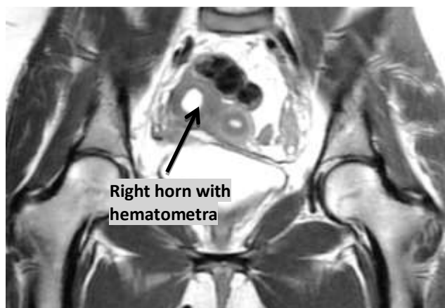
Fig. 1. The MRI imagine shows left unicornuate uterus and right rudimentary horn with hematometra

Magnetic resonance imaging without intravenous contrast was performed. The images through the level of the pelvis demonstrated a left sided unicornuate uterus with a single vagina and a single cervix. The right non-communicating horn contained hematometra. Furthermore, small cysts were found in the right ovary (Fig. 1).