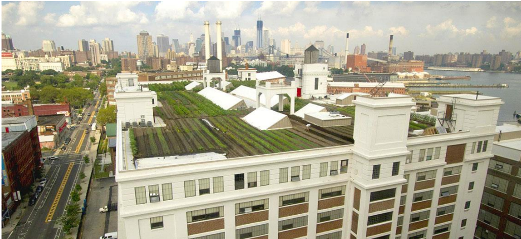
Fig. 1. The Brooklyn Grandge Roof Farm in New York.

• Brooklyn Grange Rooftop Farm, located in New York City, is a farm on two covers with a total area of 10100 sq. m. From them, 20 tons of vegetables and spices are extracted annually. The production is directed to local restaurants, shops and markets. Besides production, the garden has an educational and social focus, and is open to anyone interested in urban farming, fig. 1.