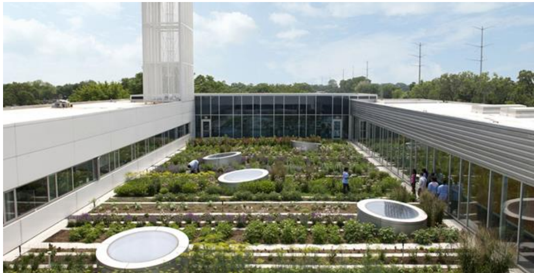
Fig. 3. Roof garden on "Gary Comer" Youth Center in Chicago.