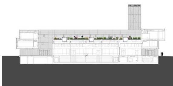
Fig. 5. Vertical location of the garden.