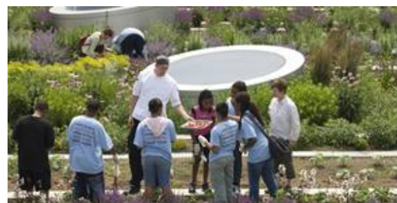
Fig. 6. Post-school activities.

The listed roof farms are a small part of the built around the world. In recent years, besides non-governmental organisations and initiative committees, the business sector has also paid considerable attention to this niche, and a number of urban administrations have prepared regulations and legal frameworks to support this process. As pioneers in this field may be mentioned the city