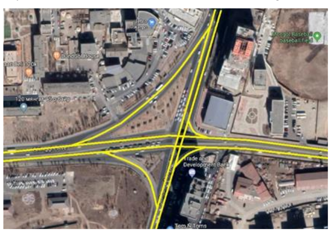
Fig. 1. 120 Intersection view from the air

The study was conducted at the 120 Intersection which is working days and busiest hours. The intersection is one of the busiest intersections in Ulaanbaatar [6]. At the intersection with high traffic load, especially at peak times, travel times increase and vehicles queue. As a result, vehicle emissions are increasing considerably. A view from the air of the intersection is given in Figure 1.