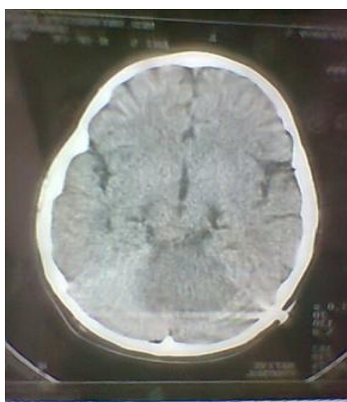
Fig.1. Preoperative CT scan

Results: Profound clinical getting better is observed immediately after the operation. Postoperative CT scans, including the last one (17 years after) are practically normal. (Shunt is detected normally functioning) The young 21 years old gentleman is University student now. He leads normal life.