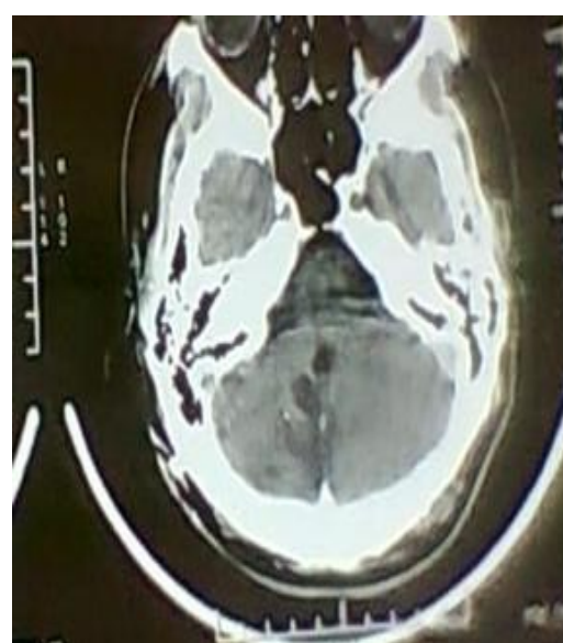
Fig.2. Postoperative result (17 years after)