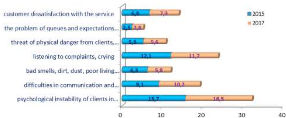
Fig.1. Diagram of comparative analysis of the impact of psychological Factors on the working conditions of social workers.

In the study of the impact of working conditions on the psych emotional state and productivity of the work of specialists, the following facts were established. Social workers of social service centers and provision of special social services experience during the day, to a greater extent, the impact of negative "psychological" factors than "physical" factors, which is due to the specifics and nature of work. More than 50% of the working time social workers at home are under the influence of "psychological" factors, rather than physical or material (Fig. 1). Comparative analysis for 2 years shows that the most significant among are the psychological instability of clients in the emotional sense, their depressiveness is 15.7% and 16.5%, difficulties in communication and communication due to the lack or lack of pedagogical-psychological experience or insufficiency work experience - 9,1% and 10,2%.