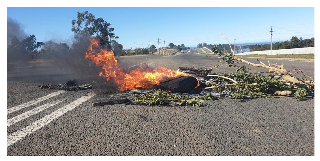
Fig. 1. The N2 freeway closure near Plettenberg Bay in July 2019 due to a service delivery protest

The purpose of any government is to organise a society or a nation into a logical unit. It drafts legislation to create a fair, egalitarian and just society in which citizens may expect to live in safety while also contributing to and benefiting from sound policymaking. However, in South Africa, the post-apartheid local government and municipalities have been struggling to provide enough services to citizens in an equitable manner. This has increased the government's primary target group from about 4 million to 50, 1 million people (Cameron, 2010). Hence, there is a greater need for proper policies to guarantee the smooth, equitable provision of services for everybody's benefit. Policy has three main components: (i) policymaking, (ii) policy execution and (iii) policy analysis and evaluation. The goal of this study is to examine the first component, policymaking, with a specific focus on reducing South Africa's high service delivery rate. Policymaking can be broken down into three additional components: (i) policy initiation, (ii) policy formulation and (iii) policy approval. One of the six administrative functions that should be carried out in a systematic manner is policymaking.