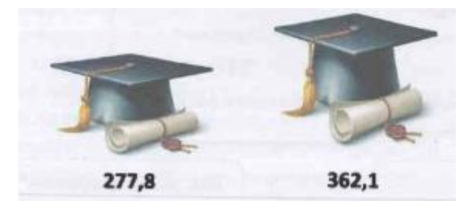
Fig. 3. Increased loan given to the young entreprenuers in 2015 and 2016 (in billion sums) [4]

- Supporting the young people, graduated colleges and want to do business, the amount of loan given to them in 2016 is 1,3 times more than the one in 2015(362.1 billion sums). (Figure 3)