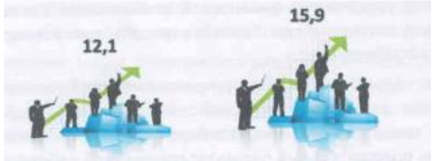
Fig. 2. Increased loans issued to small business in 2015 and 2016(in trillion sums) [3]

Looking at the examples below, given opportunities to entrepreneurs can be clearly understood: