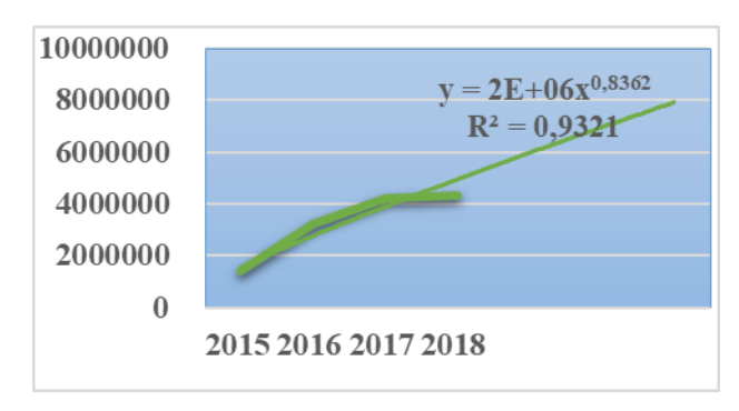
Fig. 3. Power trend.