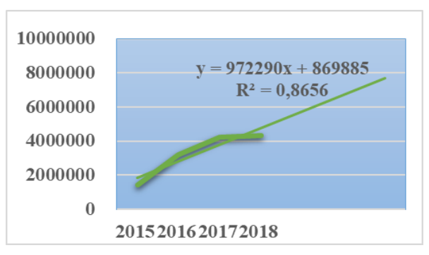
Fig. 1. Linear trend.

After constructing the constraint graph (fig. 1), the linear trend is predicted and calculated by graphic method.