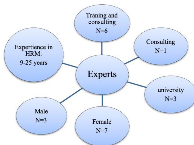
Fig. 2. Expert characteristics

They are experts of the field of HRM, and the information they provided is true reflection of current state in this area. They come from diverse organization ranging from consulting companies to training centers to universities. Their working experience in HRM consulting, training, and research field ranges between 9 and 25 years (Figure 2).